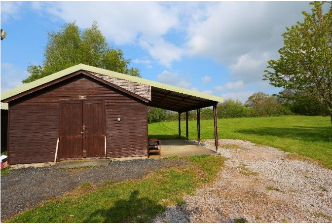
Top Meadow shelter