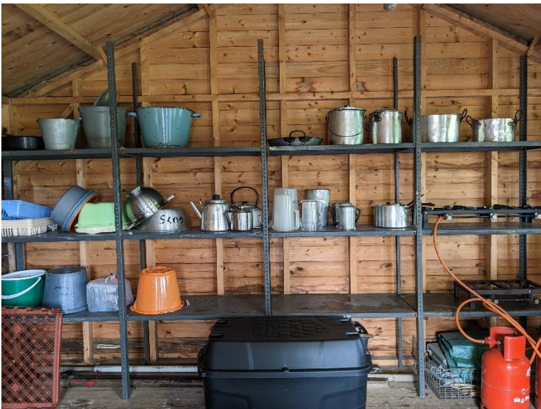
Top Meadow shelving unit with catering equipment. For full list see page 9