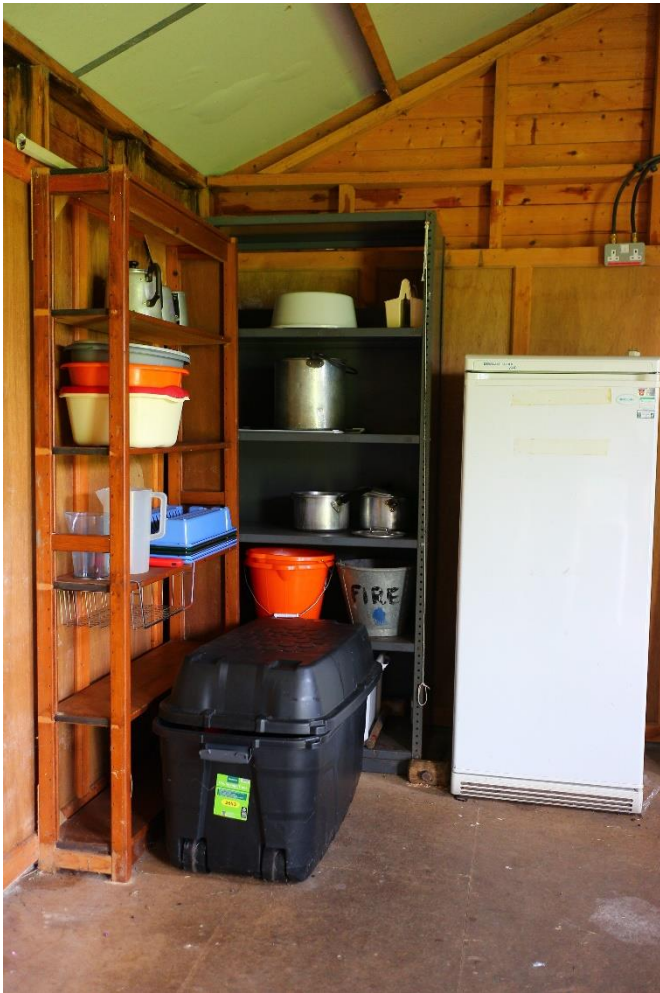
The Orchard shelving unit with catering equipment. For full list see page 9