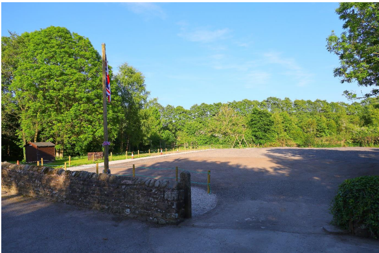
Car park at Guys Farm

Arrivals and Departures. The leader of each group is responsible for directing parent's cars on arrival and departure and should designate a responsible adult to undertake this task. High-vis jackets are available in each building and should be used when carrying out this task. Please inform the booking secretary of your arrival and departure times.